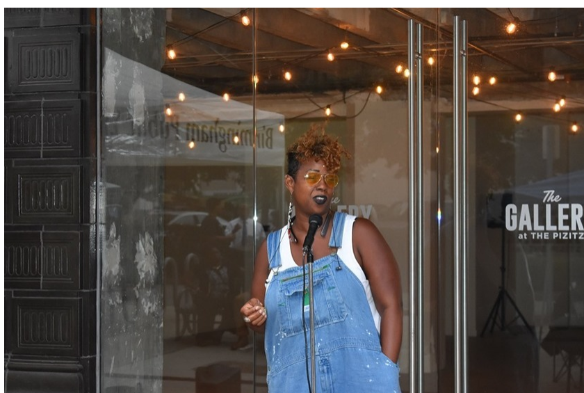
Performer at June's Bards & Brews at Birmingham Art Crawl