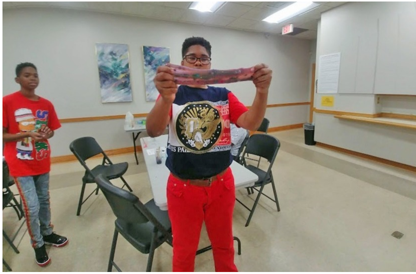
A teen makes slime at Smithfield Library's afterschool Slime Lab